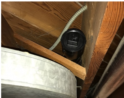
Up in your utility room rafters or in the attic rafters