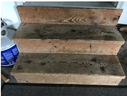
Under stairs (could get 2-3 S.T.O.W.S in there)

Some of the best places to hide things are “under one’s nose, under one’s feet, or over one’s head”. The S.T.O.W. was designed to be hidden or buried.